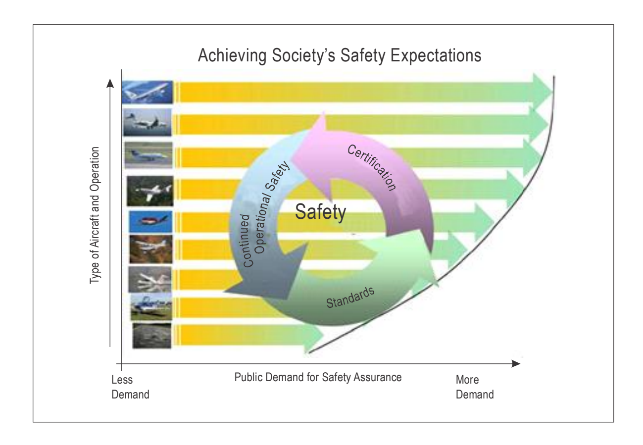
Figure V-7-C-2. Example of achieving society's expectations

The two aspects above indicated are depicted in Figure V-7-C-2.