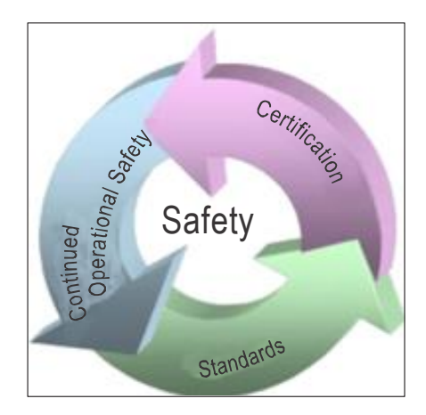
Figure V-7-C-1. Basic concept of the safety continuum

In understanding the safety continuum, it is helpful to describe what it is not: